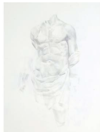
Nick Mourtzakis Dias. Olympia 2008 Graphite 37 x 31 cm