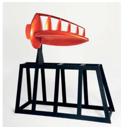
Geoffrey Bartlett Central Australian landscape (Tanami - Rabbit flat) 2009

Steel, paint and mixed media 190 x 175 x 50 cm